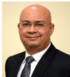
ED, ICICI Prudential Life Insurance Company Limited